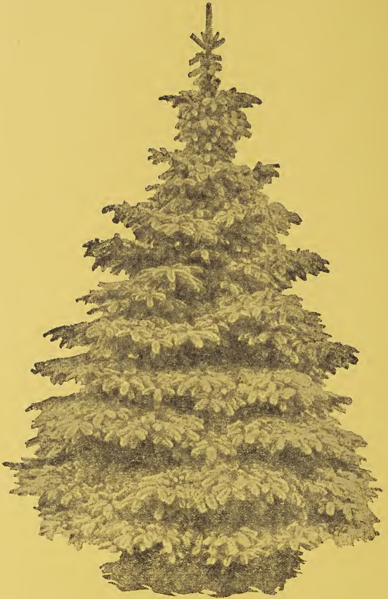
KOSTERS BLUE SPRUCE